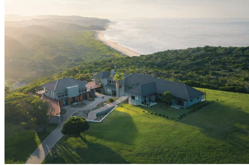
WESTERN CAPE, SEDGEFIELD, SOUTH AFRICA