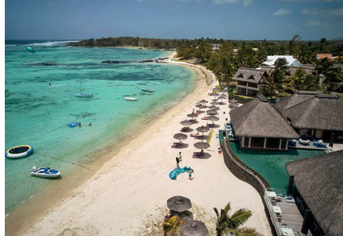
PALMAR BEACH, NORTH-EAST COAST MAURITIUS