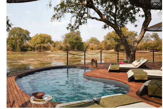
MANA POOLS NATIONAL PARK, ZIMBABWE