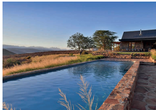
WESTERN CAPE, CLANWILLIAM, SOUTH AFRICA

Above the quaint town of Sedgefield in the Garden Route, commanding majestic views over Swartvlei Beach, Swartvlei Lagoon and the Outeniqua Mountain range, this Western Cape wonderland is situated on a 600-hectare pristine fynbos conservancy and protea farm featuring eland, zebra, waterbuck, bushbuck and caracal.