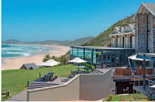
WESTERN CAPE, KNYSNA, SOUTH AFRICA