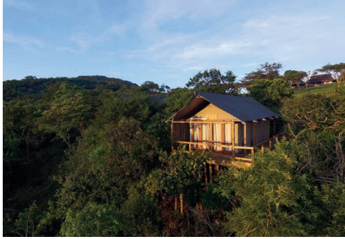
MPUMALANGA, MBOMBELA, SOUTH AFRICA