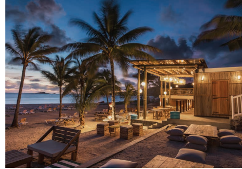
PORT SUD-EST, MOUROUK, RODRIGUES ISLAND