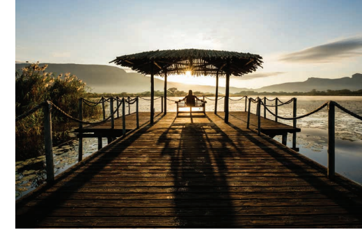
KWAZULU-NATAL, MKUZE, SOUTH AFRICA