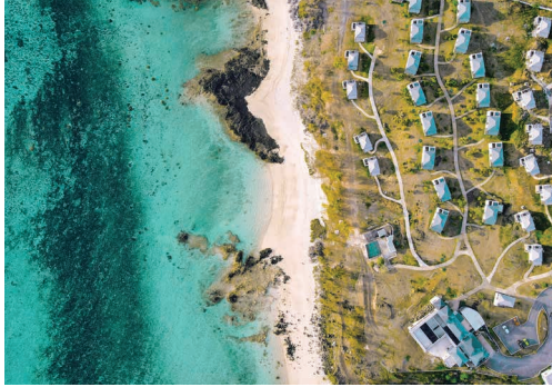
ANSE ALLY, RODRIGUES ISLAND