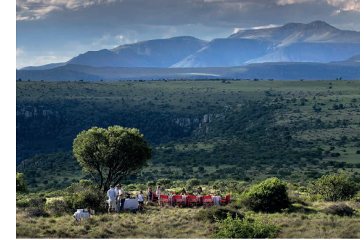
EASTERN CAPE, GREAT KAROO, SOUTH AFRICA