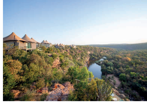
LIMPOPO, LAPALALA WILDERNESS RESERVE, SOUTH AFRICA