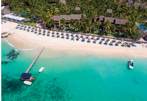
EAST COAST, MAURITIUS