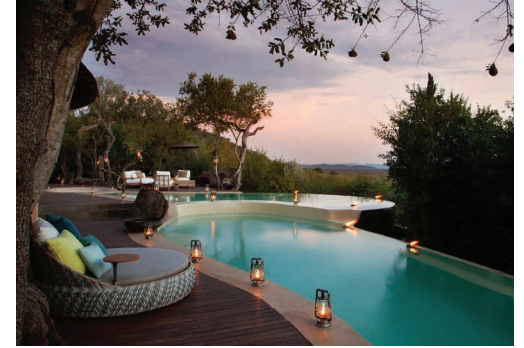
NORTH WEST PROVINCE, MADIKWE GAME RESERVE, SOUTH AFRICA