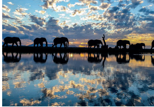
LIMPOPO, KAPAMA PRIVATE GAME RESERVE, SOUTH AFRICA