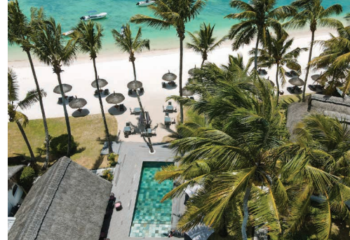
NORTH-WEST COAST, MAURITIUS