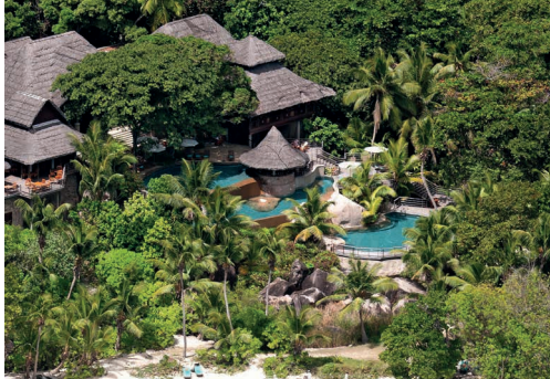
PRASLIN ISLAND, SEYCHELLES