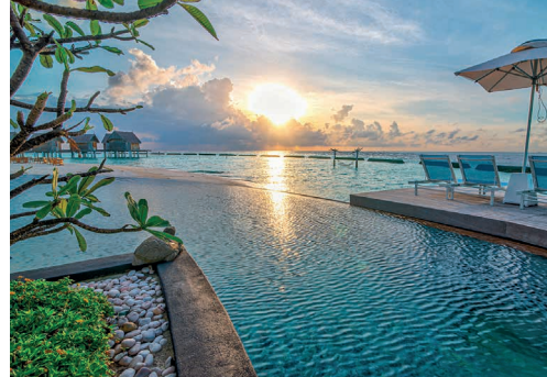
SOUTH ARI ATOLL, MALDIVES