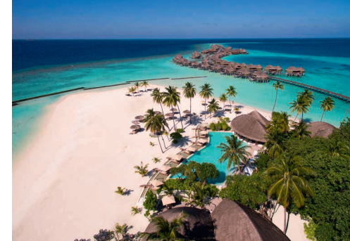
NORTH ARI ATOLL, MALDIVES