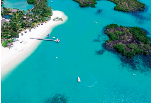
NORTH-EAST COAST, MAURITIUS