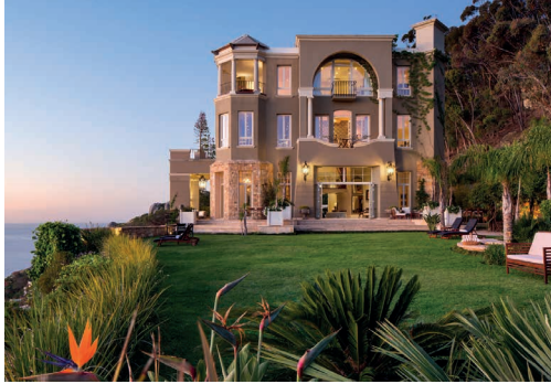
WESTERN CAPE, CAPE TOWN, SOUTH AFRICA