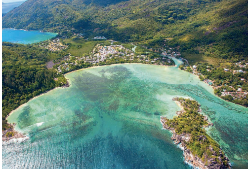
MAHÉ ISLAND, SEYCHELLES