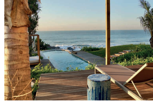
KWAZULU-NATAL, NORTH COAST, SOUTH AFRICA

Cederberg Ridge is a luxurious wilderness lodge offering excellent food, hospitality and adventure. Overlooking the panorama of the Cederberg Mountains with its unique raw, rugged beauty, this stylish 'away-from-it-all' experience is within easy reach of Cape Town.