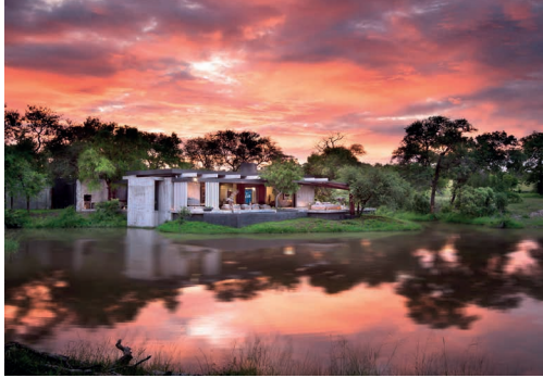
MPUMALANGA, SABI SAND GAME RESERVE, SOUTH AFRICA