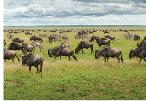
TANZANIA, EAST AFRICA