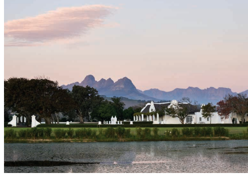
WESTERN CAPE, SOMERSET WEST, SOUTH AFRICA