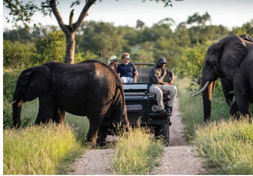
MPUMALANGA, TIMBAVATI PRIVATE NATURE RESERVE, SOUTH AFRICA