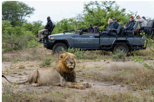
MPUMALANGA, KLASERIE PRIVATE NATURE RESERVE, SOUTH AFRICA