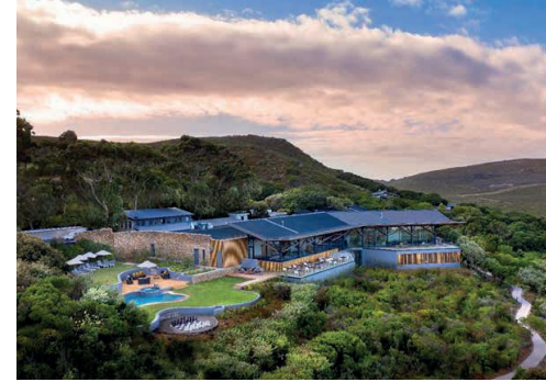
WESTERN CAPE, GANSBAAI, SOUTH AFRICA